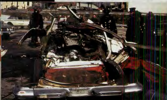
favorite: Four people were killed aboard TWA Flight 840 from Rome to Athens in 1986, by a small explosive device placed under seat cushion. (above, right) Individual targets of terrorism are attacked when most vulnerable — often when traveling in a car.