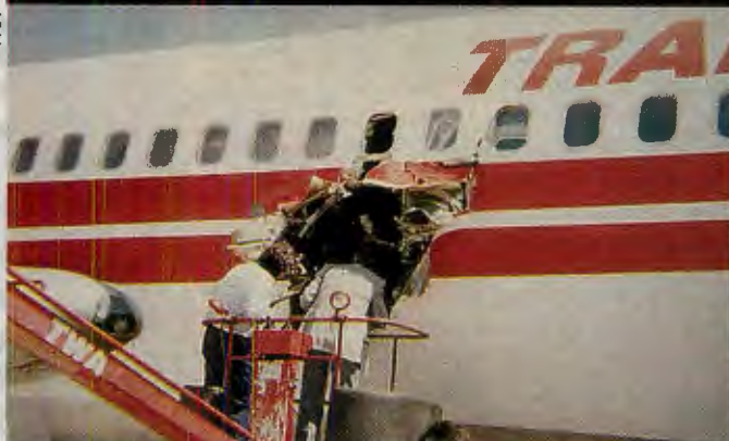
(top) The terrorist: shadowy specter haunting the late 20th century, here in the form of a hooded "Black September" terrorist looking over the balcony at Olympic Village in Munich, during September 1972 massacre of 11 Israeli athletes. Simple dramatic weapons that can cause dramatic results (above, left) have always appealed to terrorists. Bombs are a

It may look good on paper, but is the definition so sweeping that it will lay waste