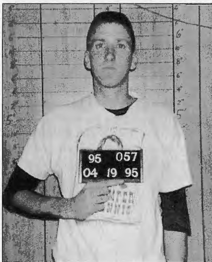
Hours after the bombing, Timothy McVeigh was arrested, and thus far is the only one convicted for the OKC bombing.