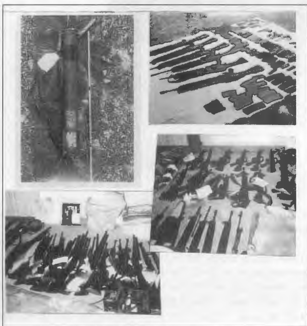
Weapons seized by FBI during CSA raid of 19 April 1985.