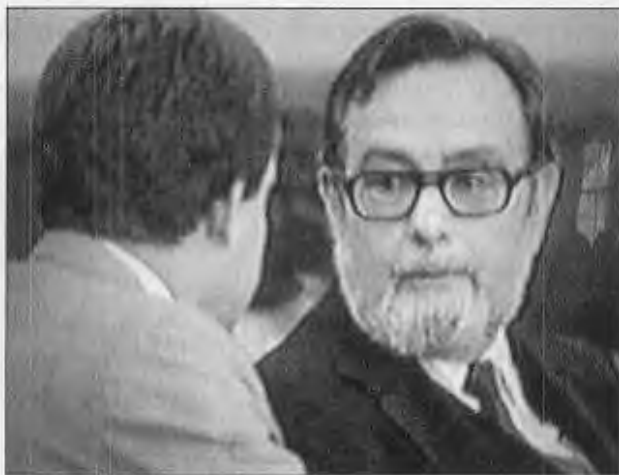
The pre-McVeigh era: Wayne Snell earlier plotted bloody mayhem for the Murrah Building in OKC but his plans were short-circuited. He was executed the same day as McVeigh's victims — 19 April 1995 — and is buried at Elohim City.

Testimony in a subsequent federal trial established that