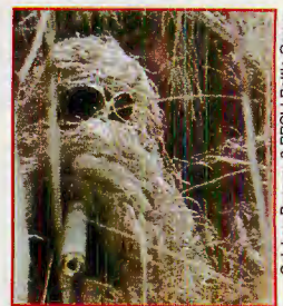
Cpl. Lou Penney, 3 PPCLI Battle Group