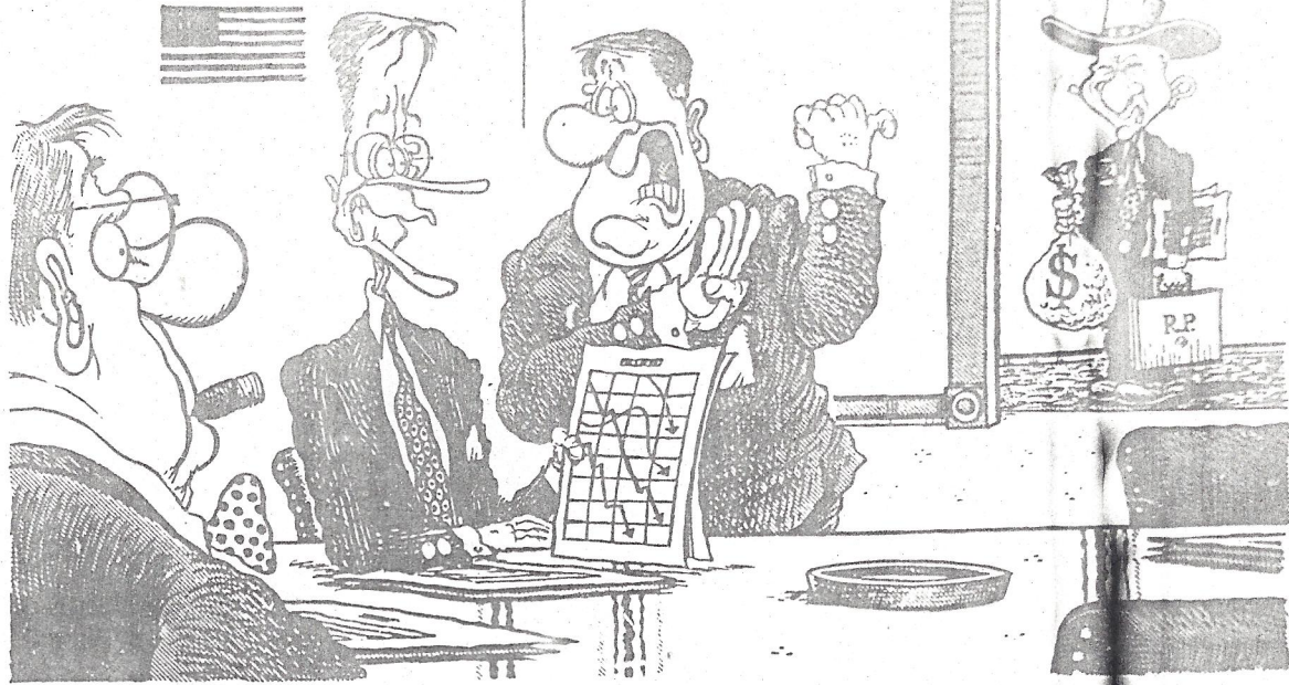
"BIG TROUBLE! ... IT'S ROSS PEROT, AND HE'S ATTEMPTING A HOSTILE TAKEOVER!"